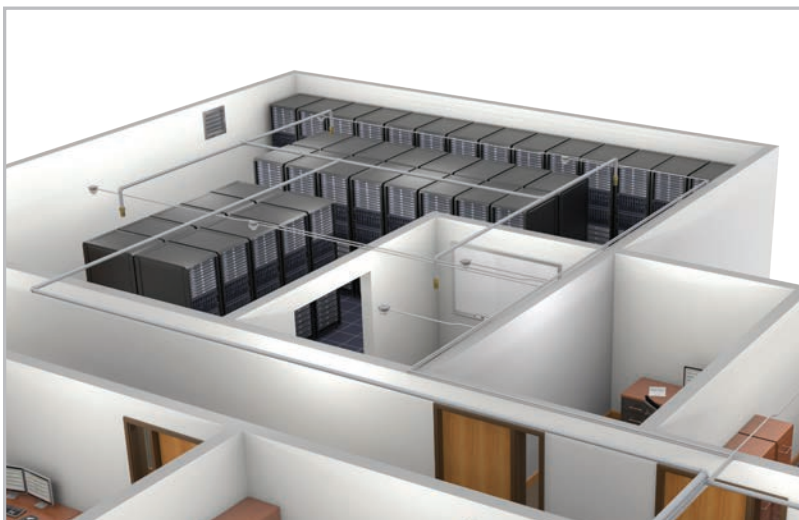
725 psi systems make it possible to locate agent supply away from the protected area.