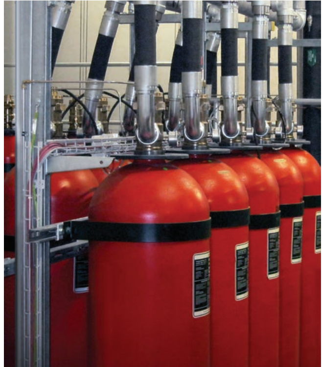
Minimax can provide multi-cylinder and multi-zone systems to protect any special hazard area